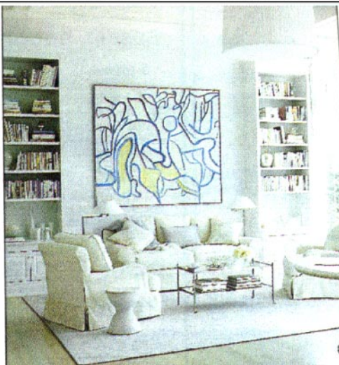
Mayflower Inn's Spa House goes man-only in Nov.